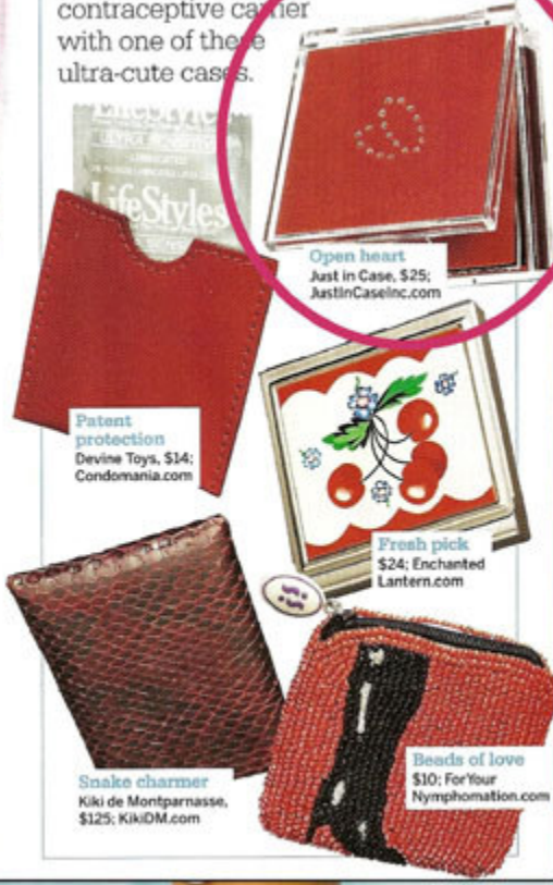
Open heart Just in Case, $25; JustinCaseInc.com

Safety in style 63% of women say they feel bashful about buying condoms, a Self.com poll reveals. No need to blush. Think of it as a shopping opportunity! Be a proud contraceptive carrier with one of these ultra-cute cases.